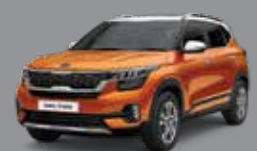
Roof: Clear White Body: Punchy Orange