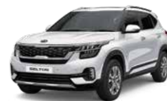
Glacier White Pearl