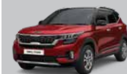
Roof: Aurora Black Pearl Body: Intense Red