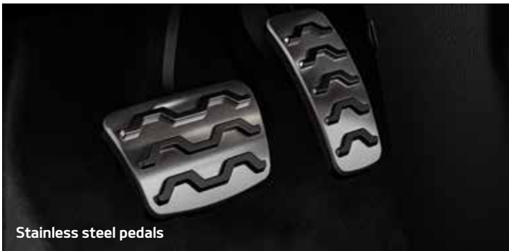
Stainless steel pedals