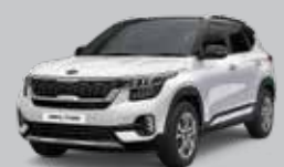
Roof: Aurora Black Pearl Body: Glacier White Pearl