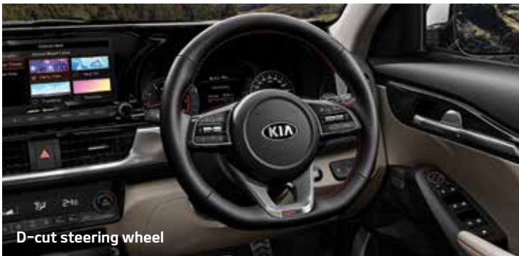
D-cut steering wheel